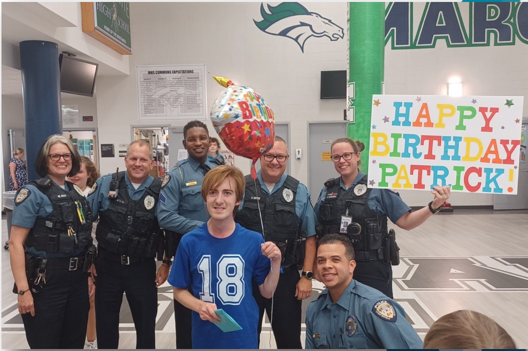
Chesterfield Officers helping our biggest fan celebrate his birthday.